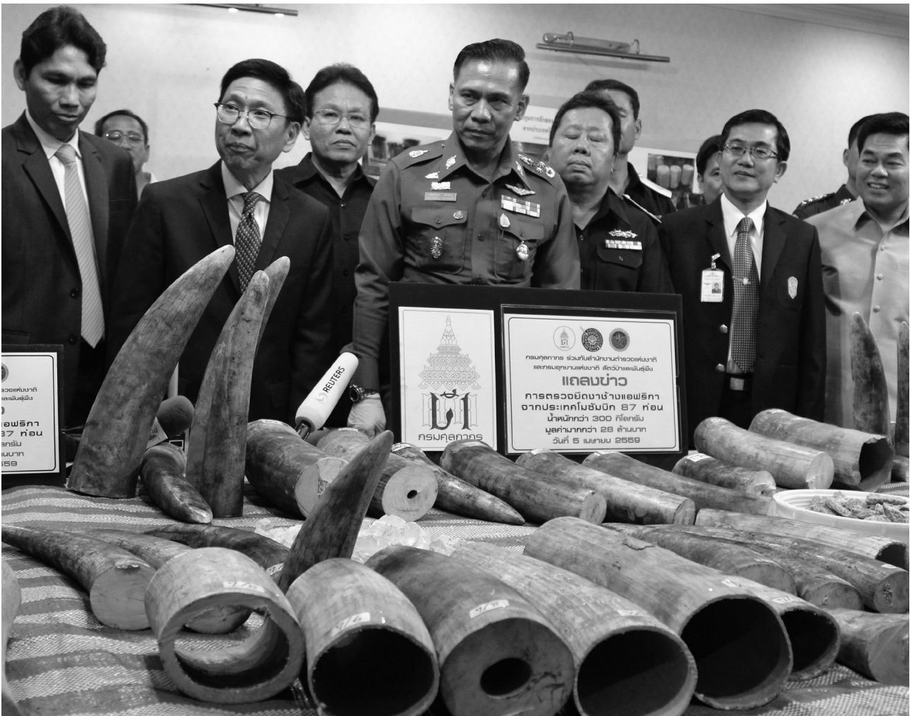
Ivory Seizure April 2016