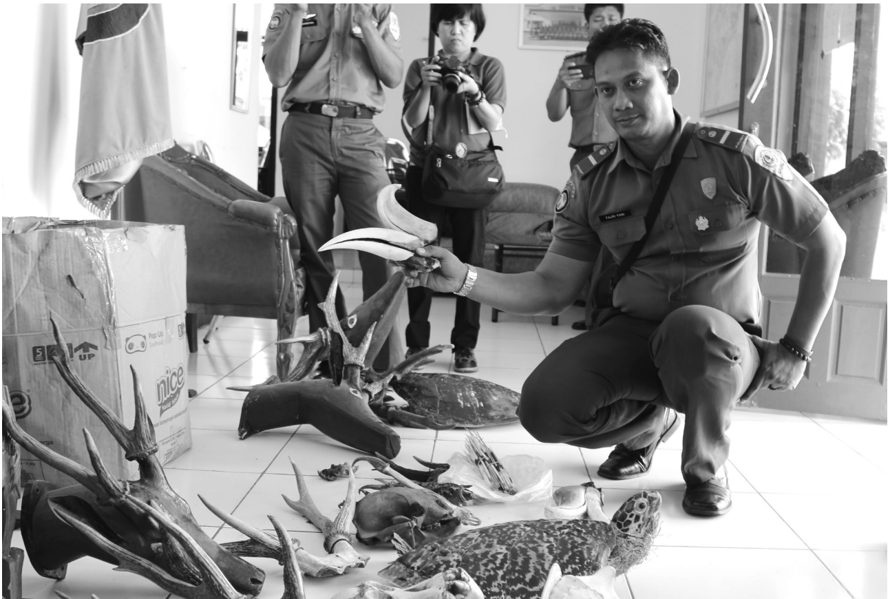
On May 11, 2016, Freeland LMED, Field Ops and Communications staff met with rangers that had received PROTECT training for validation purposes. They shared a recent seizure from a nearby wildlife product shop, including orangutan skulls, pangolin skin, turtle, sun bear skull and paw, hornbill beaks and more

relationships with traders in South Africa and Mozambique respectively, venturing out further to other countries too. Chai supervised a team of Thais and Vietnamese in South Africa, where