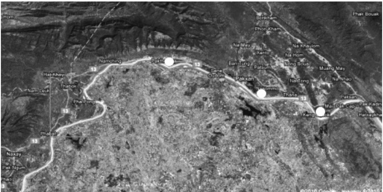
Google, Digital globe: Location of Laos Breeding Facilities: located near official and unofficial border crossings.

price of the stock. Stock would then be exported to Vietnam, usually through Lak Sao, or directly