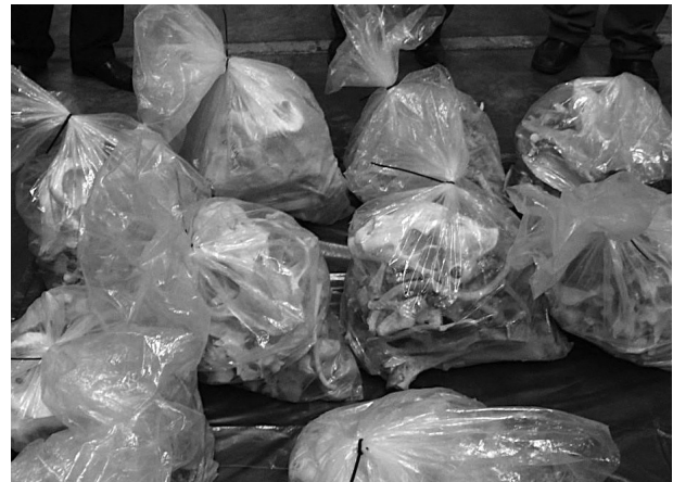
South African lion bones in transit at Bangkok Airport, en-route to Vietnam

Each member committed to forming multi-agency 'WEN' task forces, with CITES focal points volunteering to coordinate the national WENs. However, the CITES Secretariat Enforcement Officer and Interpol criticized the members for not understanding the need for police to lead this law enforcement network. CITES officers were notably offended and appeared determined to prove them wrong.