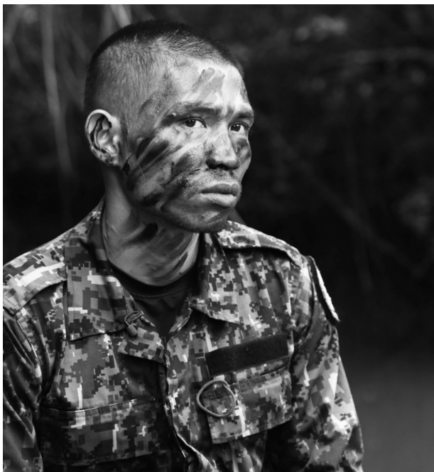
PROTECT Training Course 2013/ NGOs helped step up enforcement in Thailand and Cambodia starting in 2000

trafficking kingpin by Freeland in the international media, and then by the Thai Police in a press conference the following week. Within months, Keosavang had largely disappeared from the scene. Meanwhile, other members of the syndicate took a more active role in supervising operations. The Bachs continued to supervise the supply line, while Keosavang himself, as well as his deputy dealers, carried on negotiations for purchase and sales. Company names