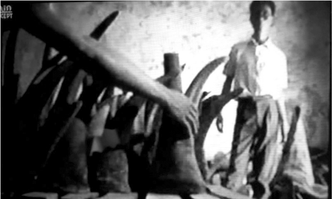
1993: Chinese wildlife Kingpin based in Zhanjiang bought rhino horn from Taiwanese dealers and North Korean diplomats.