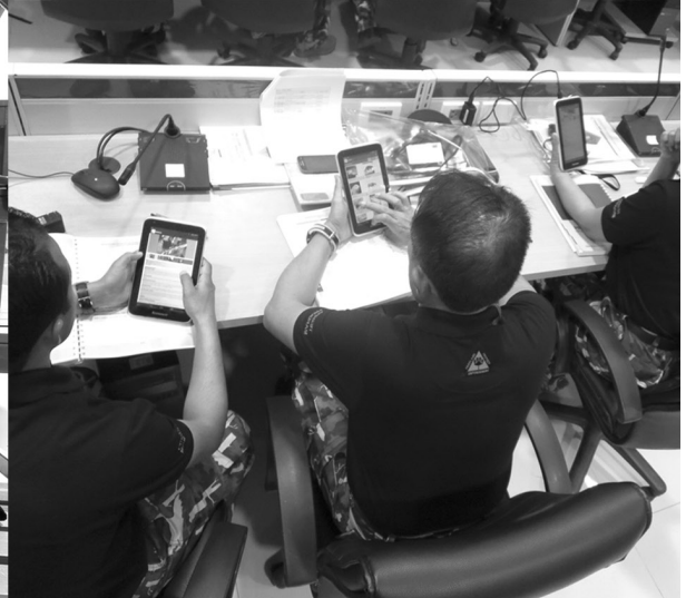
Examples of Freeland's PROTECT Course in Action