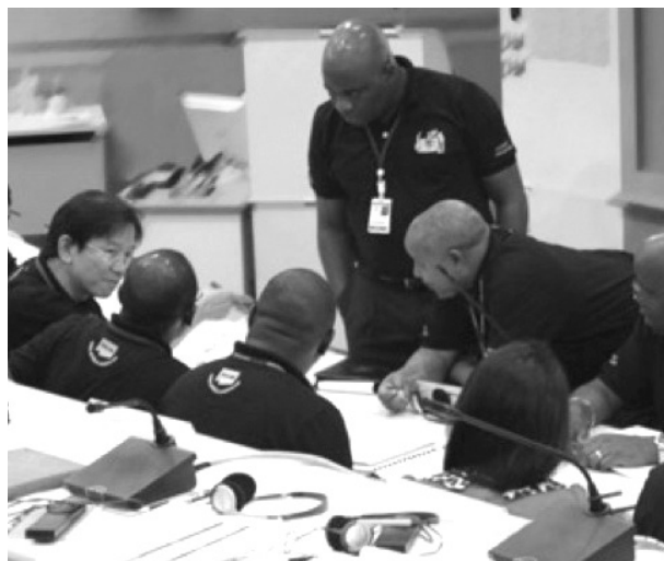
SIG participants trained jointly together and planned Operation Cobra

With ASEAN-WEN, Asian CITES agencies were no longer fighting wildlife crime alone as Police and Customs were took greater interest.