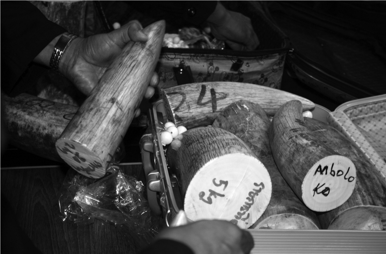
Ivory Seizure by customs

This report represents over 60 years of pooled experience of Freeland staff working to support government CWT efforts. The report aims provide historical context to crime and counter-trafficking efforts in Southeast Asia. It may be considered a snapshot of wildlife crime and enforcement in the region today, or as a guide to planning better enforcement activities.