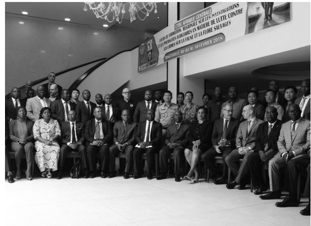
CTOC Lusaka, Zambia (February 2018) “Converging international law enforcement covering the supply chains of the trade routes used for endangered species trafficking continues to be a top priority”

To understand why we recommend the participation of non-traditional actors, we must trace the story of wildlife trafficking and countermeasures from origin, attempting to answer two questions: a) How did the wildlife trafficking crisis evolve; and b) What has already been tried to solve it?