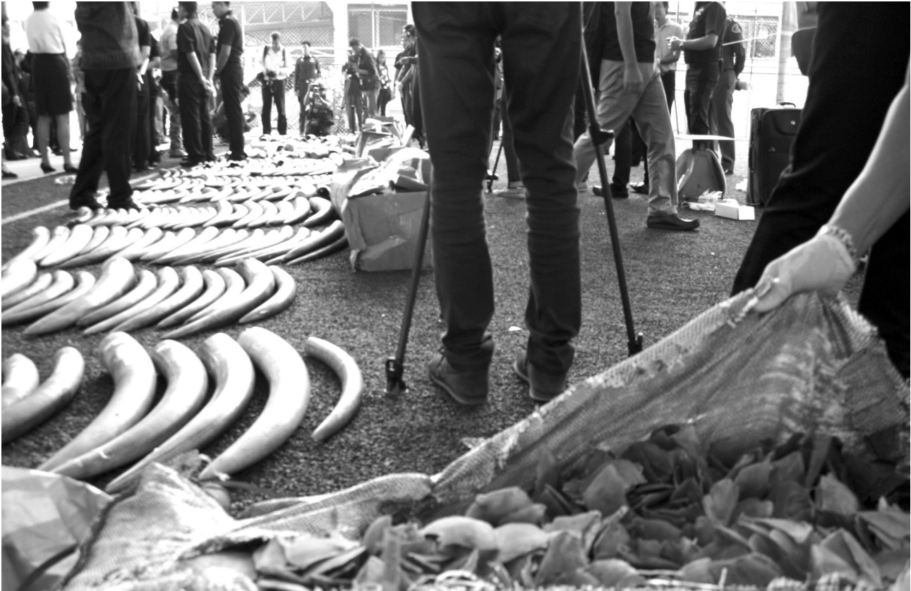
On December 18, 2015, Thai customs seized body parts representing 140 poached African elephants and well over 1,000 African pangolins, which were concealed in freight marked as “wigs” traveling from Nigeria to Laos via Singapore and Thailand. The body parts have a market value of 40 million baht (US$1.1 million), and aroused suspicion among Customs officers at Samui International Airport because the boxes weighed over 1,200kg in total – much more than they would have had they contained wigs.

Chonburi), Hong Kong and mainland China. These companies are largely owned and run by Africans claiming Mali and The Gambia as their nationality.