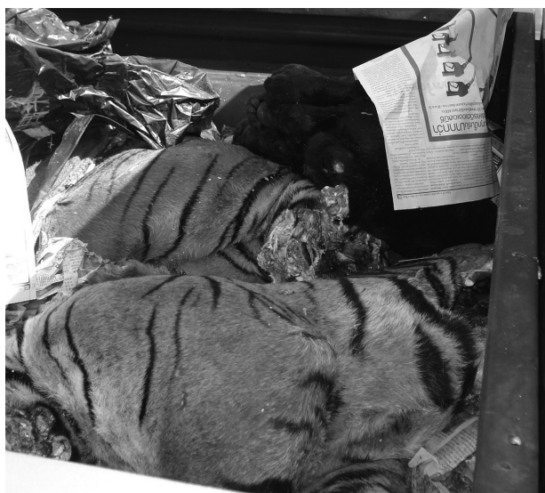
Once a common scene: Thai Highway Patrol Police Seize Tigers Smuggled from Malaysia in Pattani in 2009

As with the China-based and Vietnam-based companies, Laos-based companies involved in wild animal trading were legally registered with the government to trade in animals, plants and sometimes other commodities (like limestone). The Laos government taxed these companies as legitimate businesses and made them pay an extra 2% to Customs for each shipment of wild animals based on the value of the animal – per head or kilo. The pricing scheme was listed in US dollars. This practice of paying Laos Customs was standard for many forms of trade in Laos order to incentivize officers to process paperwork more efficiently. With individual wildlife shipments valued in the hundreds of thousands of dollars (and sometimes millions), Customs officers worked more efficiently. Some would even help unload shipments of poached